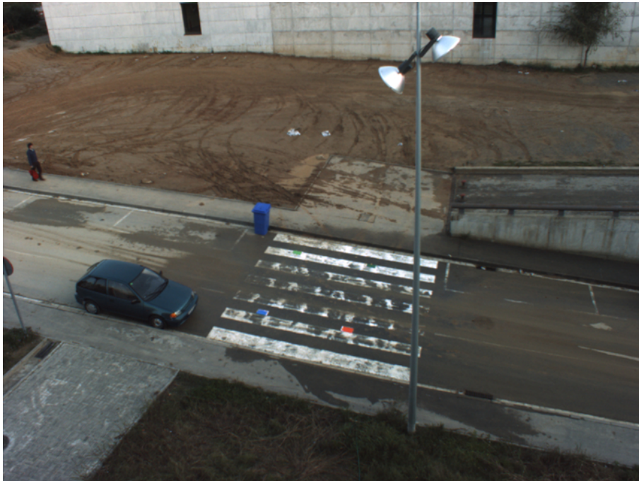
Figure 2.1: This is a snapshot of the video sequence CVC_Outdoor_Cam1 at the time-point 453. An agent enters the scene in the upper left corner of the image.

Using tracking results by Roth et al. [2008] from ETHZ for the video sequence CVC_Outdoor_Cam1 , a few sentences have been generated in Danish and listed in Table 2.1. The corresponding German text is listed as well. A snapshot of the scene at time-point 453 is shown in Figure 2.1.