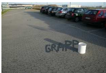
Figure 5: Shadow manually drawn into image. The pixel values inside the artificial shadow is automatically determined. Using this approach we intend to solve the shadow protection problem in order to avoid double shadows.

It would also be interesting to measure the performance of the technique presented in this paper against light probe images to establish the degree of absolute accuracy.