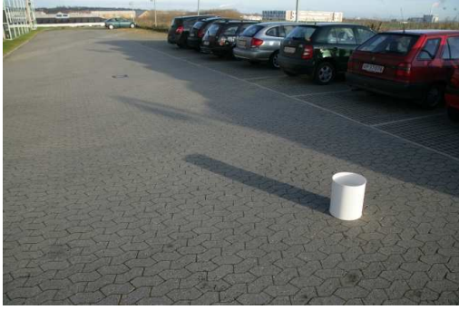
(a) Input image