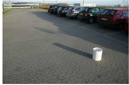
(a) Input image

Figure 3 visually illustrates the illumination estimation for a given scene. Notice how the color of the Sky dome corresponds to the actual Sky color in the image, although this information has not taken part at all. The only information used is the overlay color resulting from finding the intensity ratio between a region in direct light and a region in shadow.