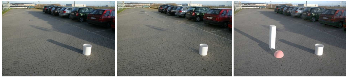
Figure 1: Illustration of idea in this work with images. Left: input image acquired outside in sunshine. Center: real shadows automatically detected and removed to illustrate performance of detection. Right: information from shadow detection step has been used to estimate Sun and Sky illumination conditions and virtual objects have been rendered into the scene with credible shading and shadowing.

reasonable, since cameras in the near future will include GPS information into the image header, as well as date and time. The second assumption is reasonable, since there is a lot of outdoor world to photograph. The third assumption is also reasonable since urban scenes have a lot of road, pavement, brick, and concrete surfaces, which all are approximately Lambertian. Moreover, we conjecture that the diffuse surface assumption can be relaxed greatly in the future due to further research.